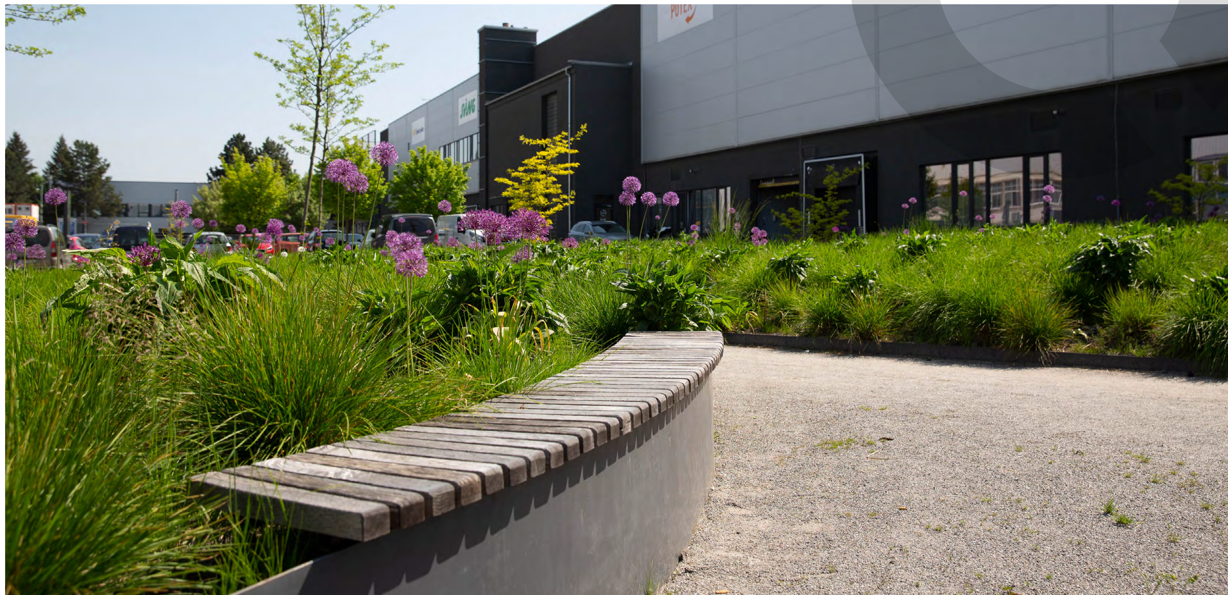
Contera Park Říčany