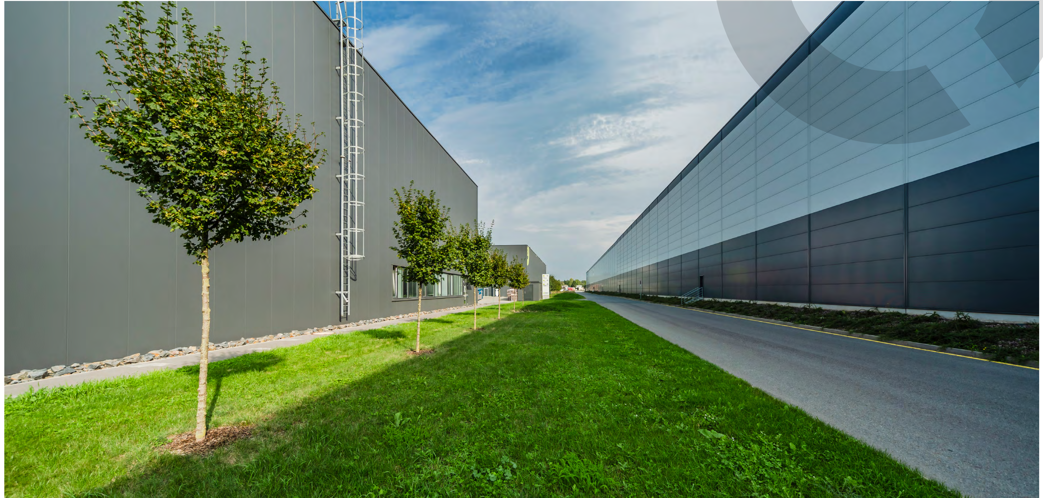
Contera Park Ostrava City