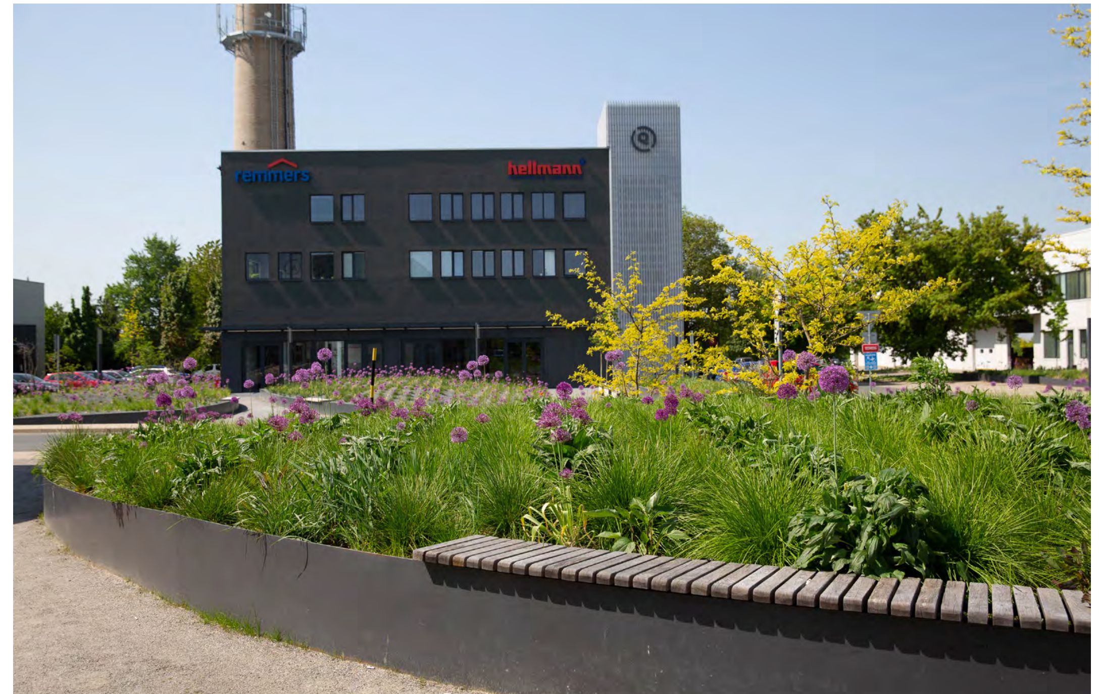
Contera Park Říčany