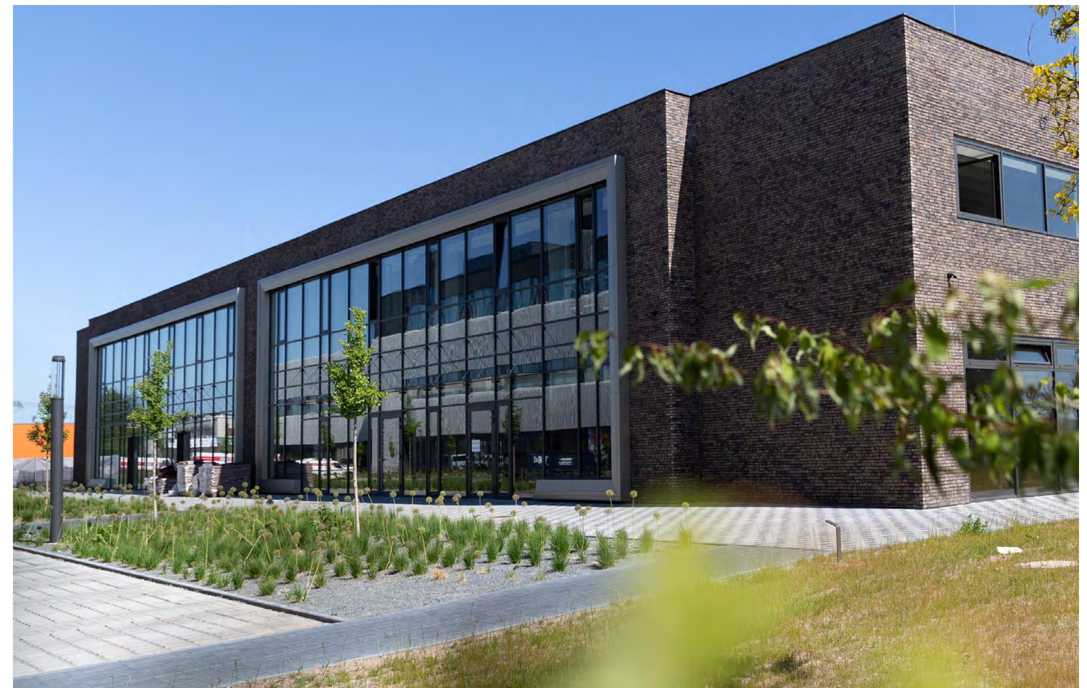
TERRA, Contera Park Říčany