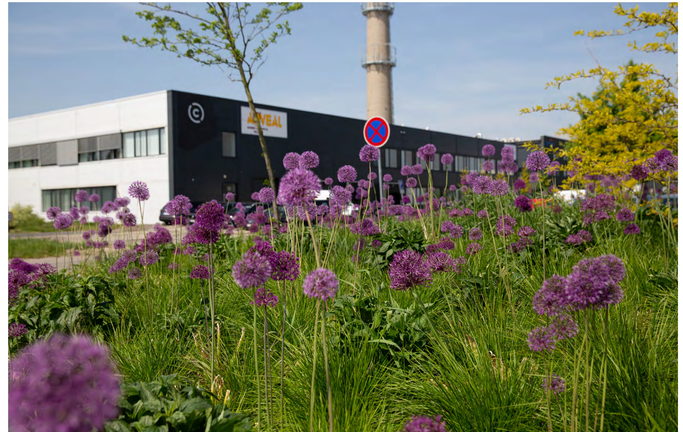
Contera Park Říčany